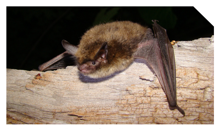
Both listed under the Endangered Species Act, the Indiana and northern longeared bats have declined in numbers partly due to the loss of mature forests, which they use for foraging and roosting. Both species are also greatly affected by a fungal disease called White-Nose Syndrome, which affects bats during their hibernation.

Sustainable forestry and invasive plant removal projects decrease the likelihood of wildfires during drought conditions, while reforestation projects increase floodwater storage and reduce nutrient loads and sedimentation during heavy storms. In addition to improving landscape resilience by maintaining and connecting healthy forests, the project also addresses habitat needs of the federally endangered Indiana bat, federally threatened northern long-eared bat, hellbender salamander, and neotropical migratory songbirds among others. Combined, these efforts have the potential to mitigate the effects of existing encroachment threats or avoid them altogether.