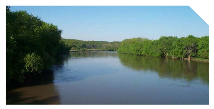
Historically, the Wabash River served as a significant transportation corridor. Today, the Wabash River and its tributaries are no longer utilized for commercial navigation, but are still a vital source of water supply and recreation in the region.